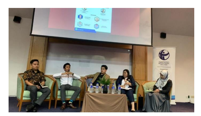
The youth panel with the moderator and academic from IIUM

In the realm of democratic governance, transparency and accountability serve as indispensable cornerstones. In light of this, the recent NextGen Party Youth Forum, held under the theme "Fostering Greater Transparency and Accountability Through Open Information Laws," provided a platform for robust discourse and insightful deliberations. Gathering esteemed speakers from various political backgrounds and academic expertise, the forum delved into the pressing need for enhanced transparency and accountability mechanisms, particularly through the lens of open information laws. The event, attended by International Islamic University Malaysia (IIUM) students and streamed live on social media platforms, offered a comprehensive exploration of pertinent issues and potential solutions.