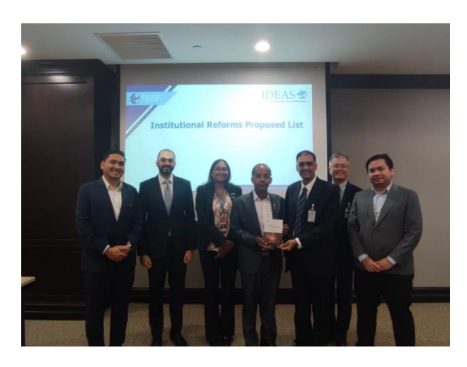
Dr Muhammad Mohan presented "The Sin of Corruption-A Religious Perspective" book to YB Kulasegaran

Transparency International Malaysia (TI-M) took a significant step forward in combating corruption presenting proposed bν amendments to the Whistleblower Protection Act to YB Kulasegaran, Deputy Minister of Law & Institutional Reforms. During the meeting, Exco Chew Phye Keat highlighted the importance of strengthening whistleblower protection in the country's legislative framework. The proposed amendments aim to enhance safeguards for whistleblowers, encouraging more individuals to come forward